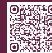
Chemistry Scan for full course information